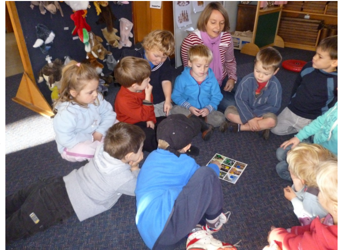
Morning children playing sounds lotto games together

Stories from Home or to Keep in touch e-mail: temata@hfka.co.nz